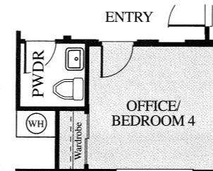
OPTIONAL OFFICE/ BEDROOM 4 at Parlor